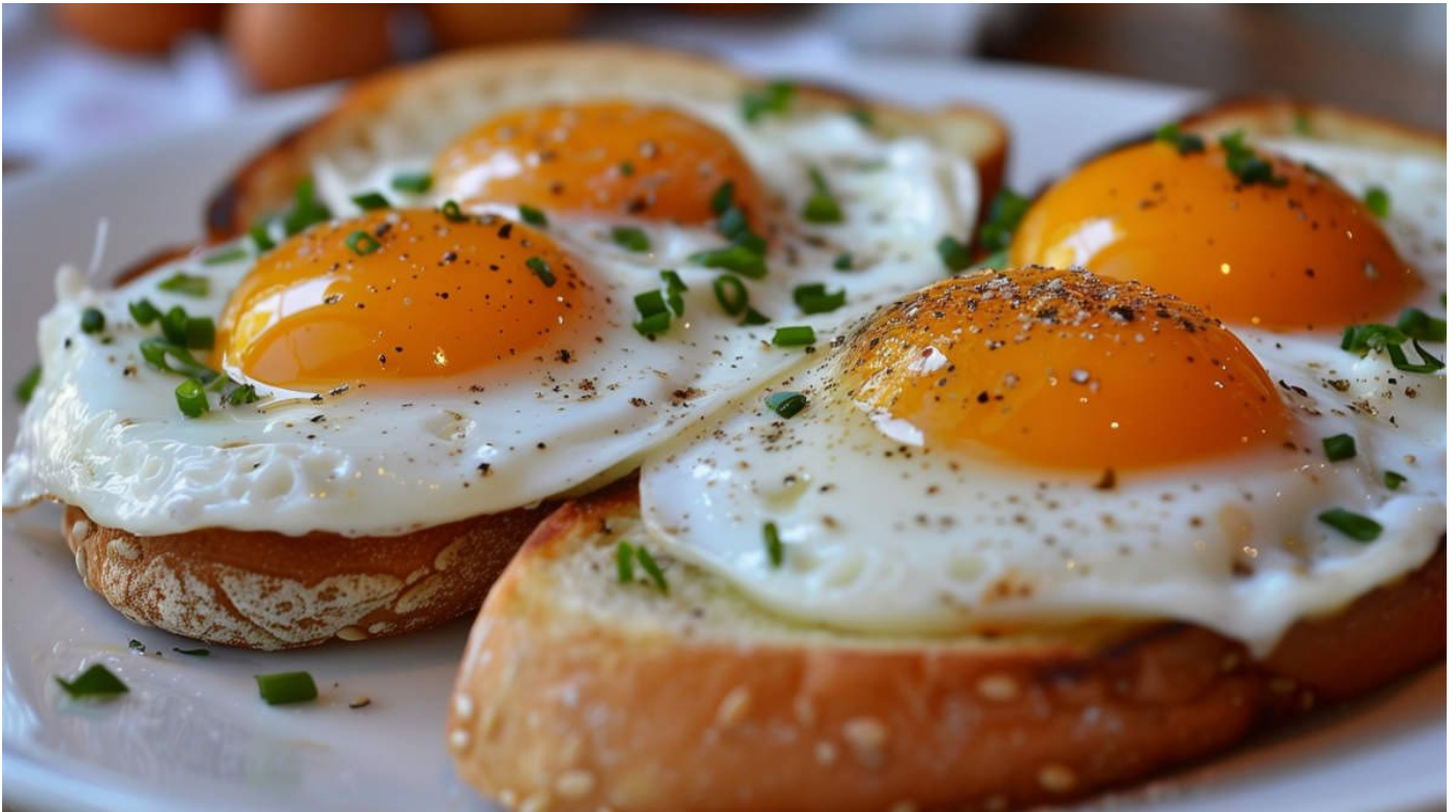
Lookalikes to the Sunnyside prospect will be targeted by Koonenberry's drilling.